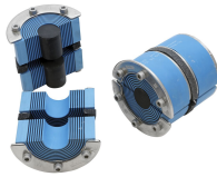
RS PPS/S F+WT seal